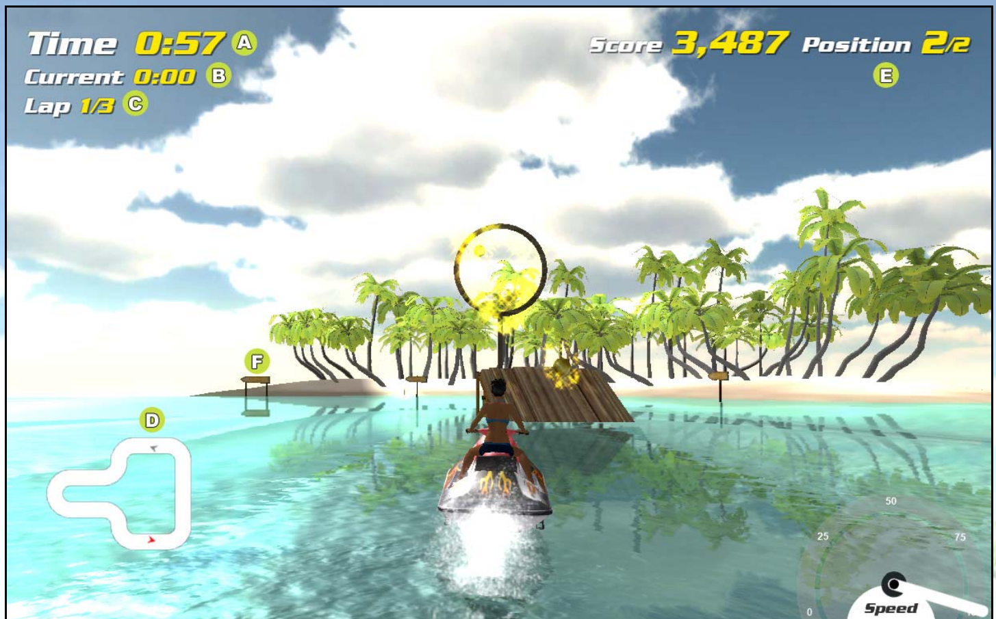
Tropical Heat racing