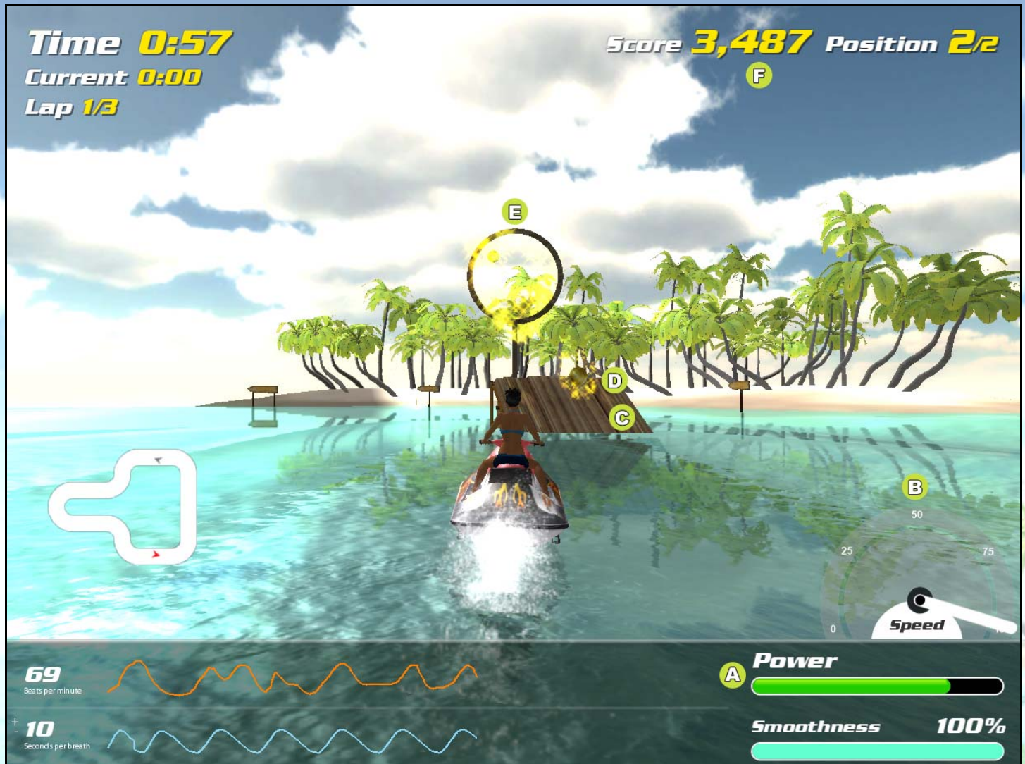
Tropical Heat power system and game play